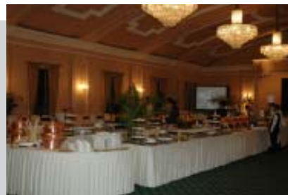
Ball Room, Oberoi Grand, Kolkata